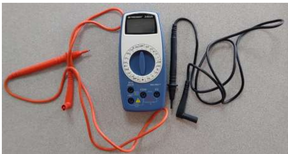
Figure 1: Multimeter and cables

Figure 1 shows a multimeter and the two terminals they come with: black & red.