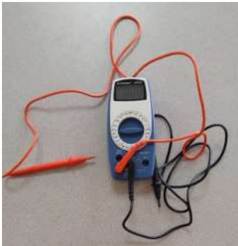
Figure 3: configuration for Galvanometer

After you have the proper cable configuration, select the function of the multimeter with the knob.