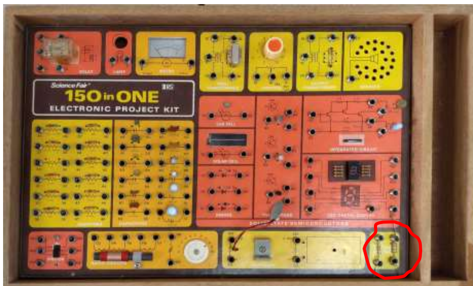
Figure 5: Electronic Panel. Circled are the two resistors to be measured.

Question 3: What is the nominal value of the two resistors in the bottom-right corner of the board (see Figure 5)? Hint: gold and silver are always at the end)