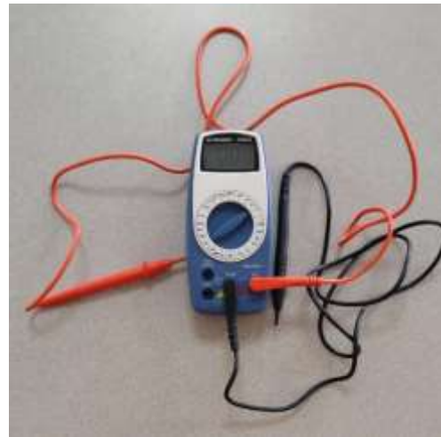
Figure 4: Configuration for Voltmeter and Ohmmeter

Activity 1. Measure the battery in the panel by touching the contact with the probes (negative with negative, positive to positive). Make sure you measure DC voltage. The battery says it is 9V, but this is the nominal (theoretical) voltage.