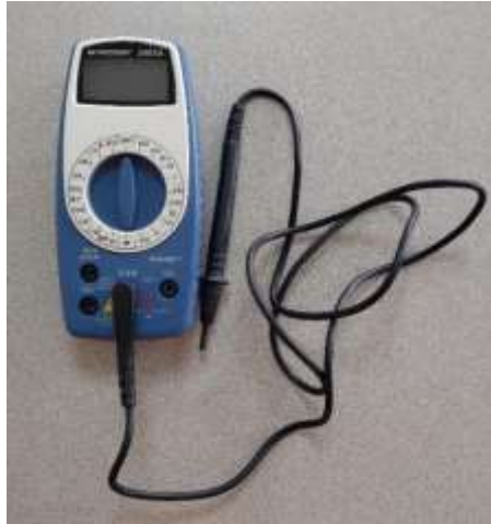
Figure 2: black cable connected

The black cable is the negative terminal, or the anode (when used to measure resistance), and the red cable in the positive terminal, or cathode. The black cable must always be connected to common ground, labeled as COM (we will see exactly what this means later in the semester); this is shown in Figure 2.